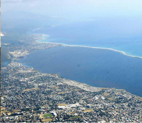
St. Andrew, Jamaica